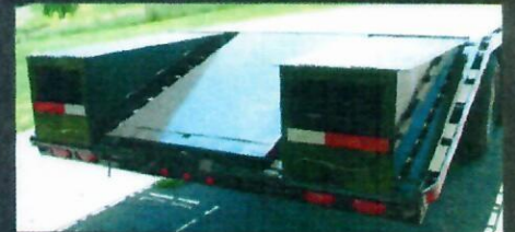
5' Middle Lift Up With Flip Over Ramps & Spring Assist