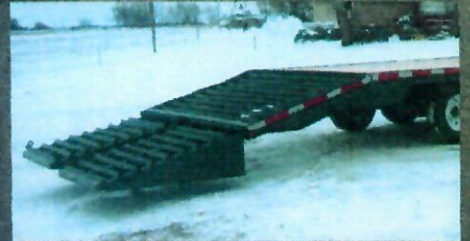
Open Angle With Split Flip Ramps & Spring Assist