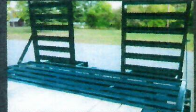
Open Angle With Fold Up Ramps