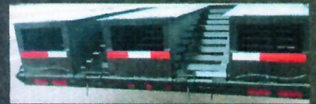
(3) Flip Over Ramps