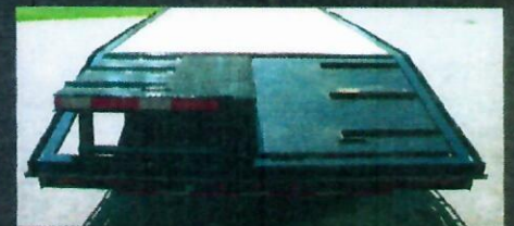
4' Split Lift Up