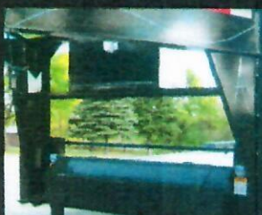
Toolbox in Neck - Above Chainbox With Lid - Below