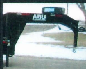
Spare Tire Bracket In Neck